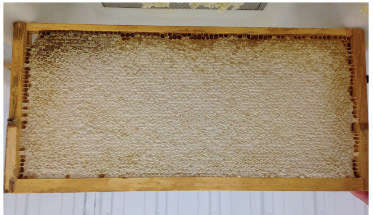
A nice June, 2014 frame of honey from Rush County!