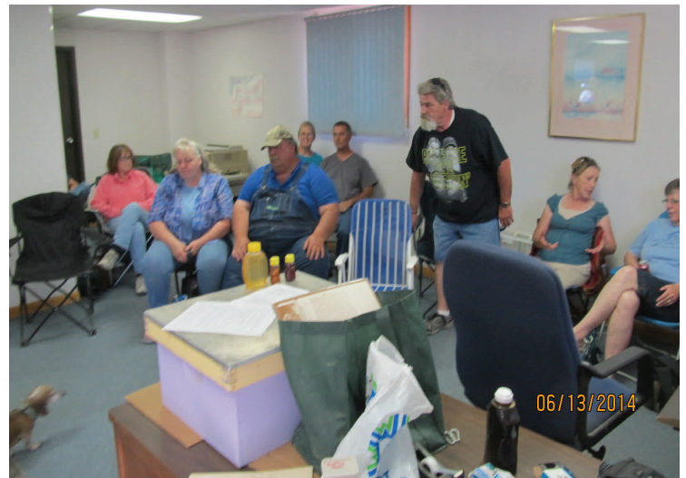
NW Ks Beekeepers meeting 6-14-2014